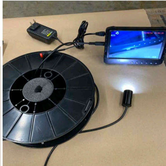
Figure 2 - Wired Camera Setup w/Kickstand used

Turn on monitor to verify picture. Locate camera in the holder and see that the picture is "right side up" and we recommend you line camera up with your ButtonLok hole. In this way you can tell direction (N-S-E-W) when scanning. Tighten the camera holding set screw with soft tip (2.5mm) so it holds the camera in that position. Then install the top cap with centering strands by screwing into place. Secure this with its set screw (3mm). There is a third set screw up inside fitting (4mm) that holds the lower centering strands. This is only loosened if you need to change these strands to make them longer for instance. Turn on lamp by pushing red button that is near the end of the camera cable video connector. You may record with lamp off or on. Move three way switch to video. Hit the record button to start recording video, you will note time counter advances. Slide switch to photo setting to grab a picture of items of particular interest. Switch back to record video setting to continue scan. Play back by moving the switch to the "play" setting. This may be done on monitor or view later on a computer (plug into USB on computer and turn on to see DCIM and Record and Photo folders). Add ButtonLok rods and proceed to scan playing out cable as you go. Be careful not to damage cable end by pulling on it. Proceed very cautiously around sharp metal objects such as liner edges or top plates as cable may catch and be damaged.