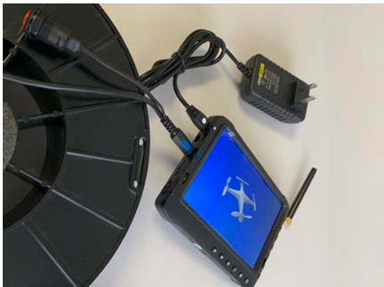
Figure 1 - Closeup of cable connections

There is a touch of paint on the cable end and monitor that will match.